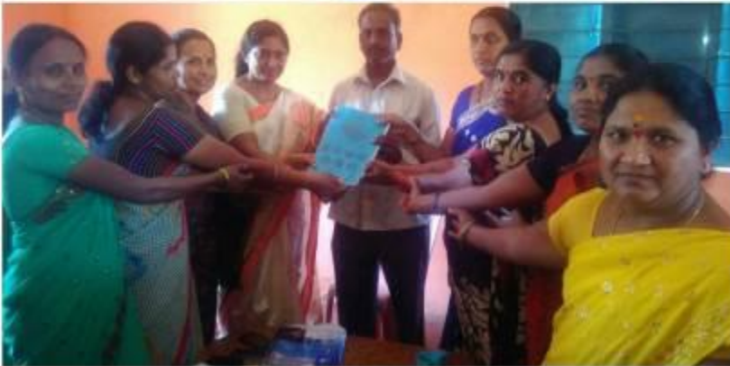
Submission of GP2RP plan in a special meeting by loosely formed federations and LRGs in Hagalwadi GP, Gubbi Taluk