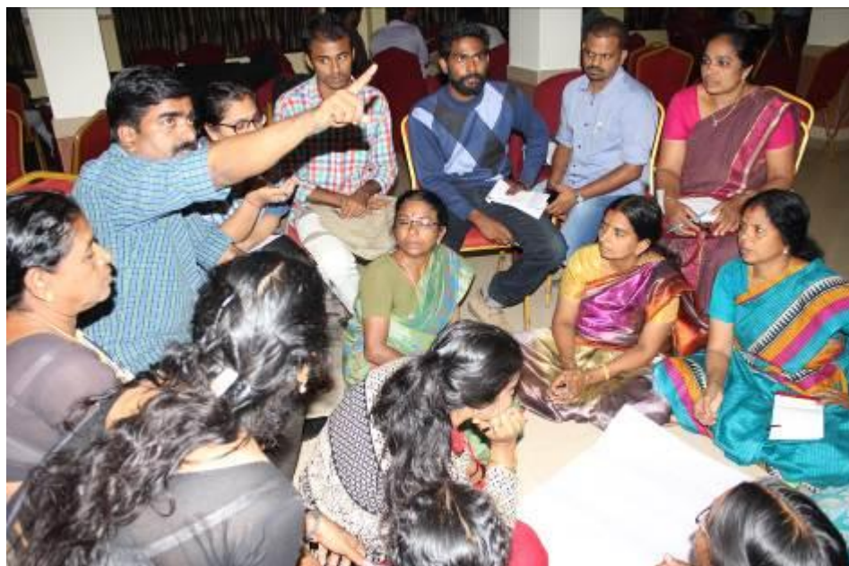
Mentors preparing for the exhibition that was held on the last day of the Mentor's Meet

During the meet, mentors documented their personal experiences of working in partner-States. These personal experiences were narrated by mentors in groups. Select mentors were presented the opportunity to narrate their personal experiences at the general plenary session of the meet and incorporate feedback received from the audience. Out of these experiences that have been collected, selected ones shall be suitably edited and published by Kudumbashree-NRO.