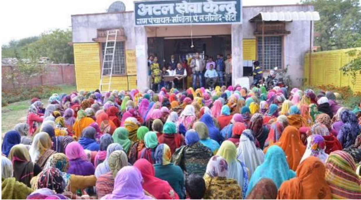
SHG members at a Gram Sabha in Mandita GP, Sangod Block, Kota District, Rajasthan on January 26, 2017