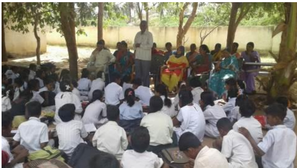
Initiative of WLF for awareness generation among school children about sanitation as part of making the GP Open Defection Free in Roopa GP, Pavagada Taluk