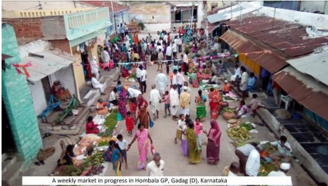
A weekly market in progress in Hombala GP, Gadag (D), Karnataka