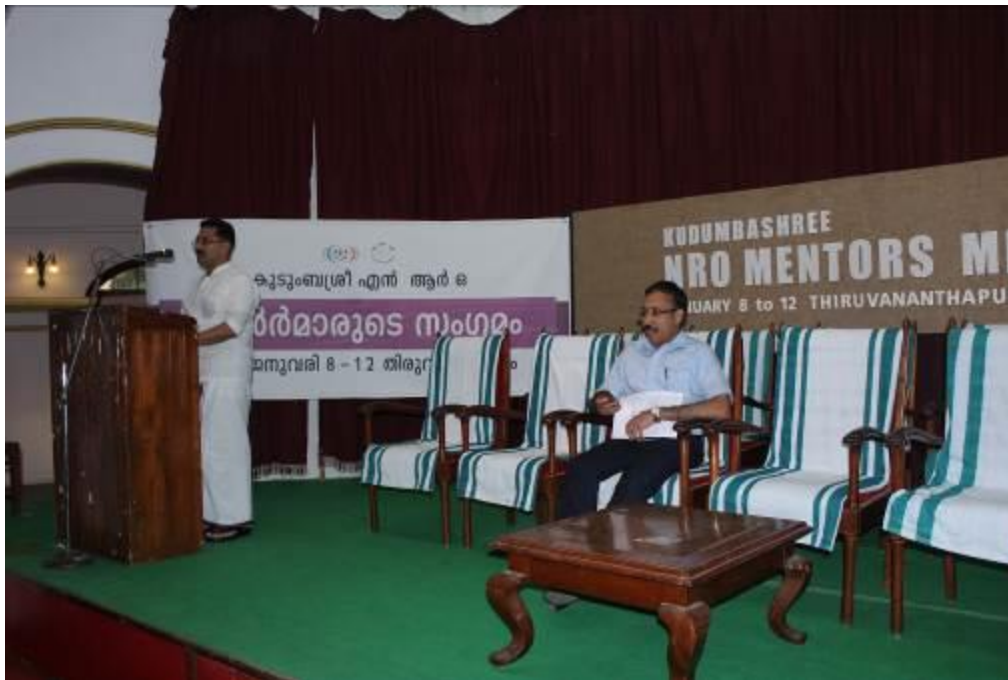
Hon'ble Minister for LSGD, Dr KT Jaleel, addressing the NRO Mentor's Meet

On the final day of the meet, an exhibition showcasing NRO's activities in each partner-State and domain was held in Kannakunnu Palace, Trivandrum. Mentors, Thematic Anchors and Field Coordinators collaborated with artists from College of Fine Arts, Trivandrum to develop innovative art and craft that communicated NRO's accomplishments. Hon'ble Minister for LSGD, Dr KT Jaleel, attended the event and interacted with the audience. Many individuals from different walks of life attended the exhibition. The event was covered by reported by media outlets such as Times of India, Deccan Chronicle, The Hindu among others.