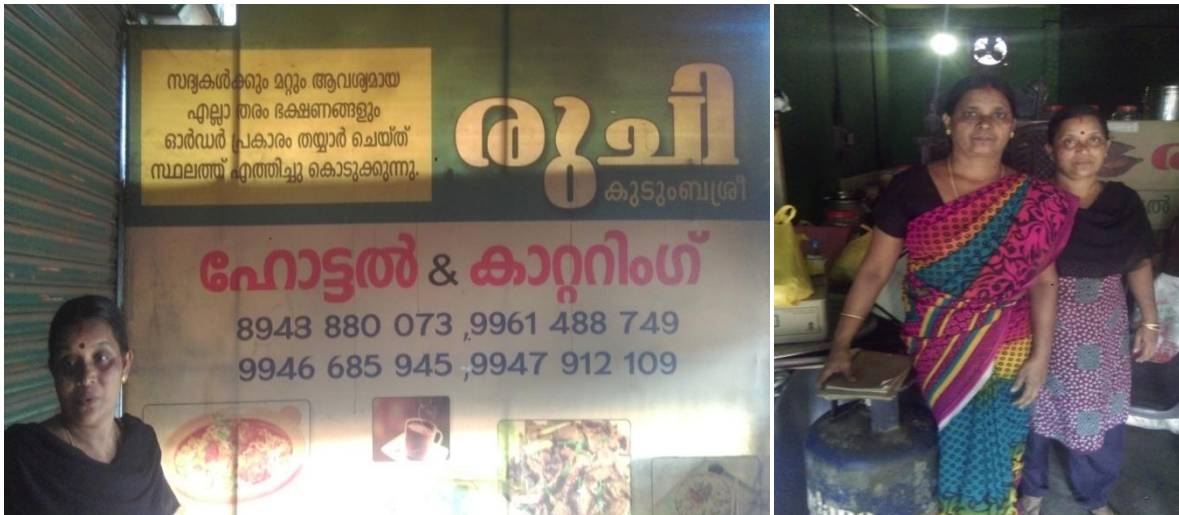
Photo of the unit