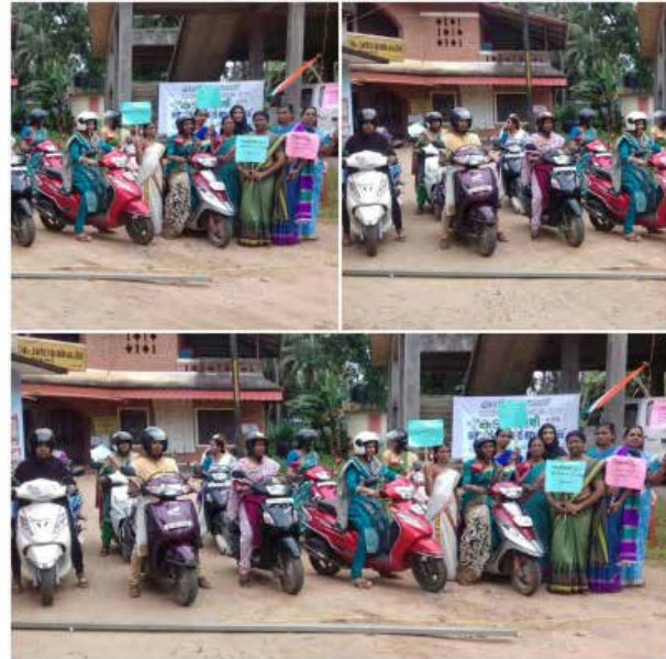
Pink task force

At the initial stage, District mission was asked to form a vigilant group at the Grama Panchayath level. After the Panchayath level formation, vigilant groups were formed in each ward of a Grama Panchayath. Viigilant group members are providing voluntary services for the community. This itself explains that how people are taking initiatives to prevent violence to create their locality women and child-friendly. Today we have total 18,204 vigilant groups in 19,411 wards across the state. Here is a chart which shows the number of the total wards and igilant group in each district of Kerala.