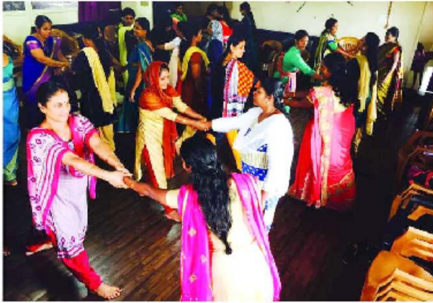
കുടുംബശ്രീ സേനകൾ പെരുമാറ്റം നിയന്ത്രിക്കാനും (പ്രിവെന്റ്), സുരക്ഷിതമാക്കാനും (പ്രൊട്ടെക്ട്) വേണ്ടിയുള്ള സേനകളായി മാറിയവയാണ് ഇവ. പല സ്ഥലങ്ങളിൽ ഇവയുടെ സേവനം നിലവിലുണ്ട്.

കൊഴിഞ്ഞുകൊടുക്കുന്ന സുരക്ഷയ്ക്ക് കുടുംബശ്രീ സേനകളാണ് ഇനി മുഖ്യസ്ഥാനം. പെരുമാറ്റം നിയന്ത്രിക്കാനും (പ്രിവെന്റ്), സുരക്ഷിതമാക്കാനും (പ്രൊട്ടെക്ട്) വേണ്ടിയുള്ള സേനകളായി മാറിയവയാണ് ഇവ. പല സ്ഥലങ്ങളിൽ ഇവയുടെ സേവനം നിലവിലുണ്ട്. പല സ്ഥലങ്ങളിൽ ഇവയുടെ സേവനം നിലവിലുണ്ട്. പല സ്ഥലങ്ങളിൽ ഇവയുടെ സേവനം നിലവിലുണ്ട്.