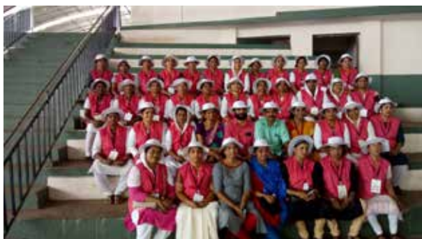
Pink Task Force

3. PINK TASK FORCE – Pink task force is the best practice of vigilant group by Kozhikode district mission. ‘Pink Task Force’ comprising 164 members (two from each panchayat). The members of this group are selected from vigilant group’s female members. Members of the Pink Task Force were trained in self-defense and had trained other members. They also coordinate with law and order officials and collect information regarding violence against women. The objective is not only to create safe neighborhoods but