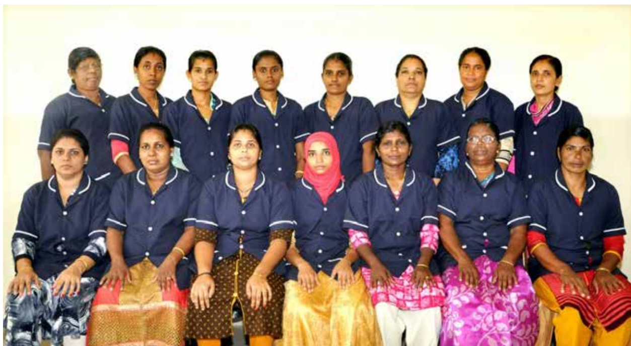
Harsham Training, Baby Memorial Hospital, Calicut

Placement assistance of Harsham trainees is vested on training agencies along with Kudumbashree. For various placement assistance, Kudumbashree is providing call centre and web portal facilities to collect requirements from the clients and ensuring timely feedback. We are also ensuring tie ups with both private health sector agencies and government organisations to provide job along with the completion of training. Also we are providing technical and financial support for care givers to form related micro enterprises.