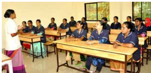
Harsham Training at Baby Memorial Hospital, Calicut

Kudumbashree's Harsham geriatric care project is designed to provide geriatric care training and placement