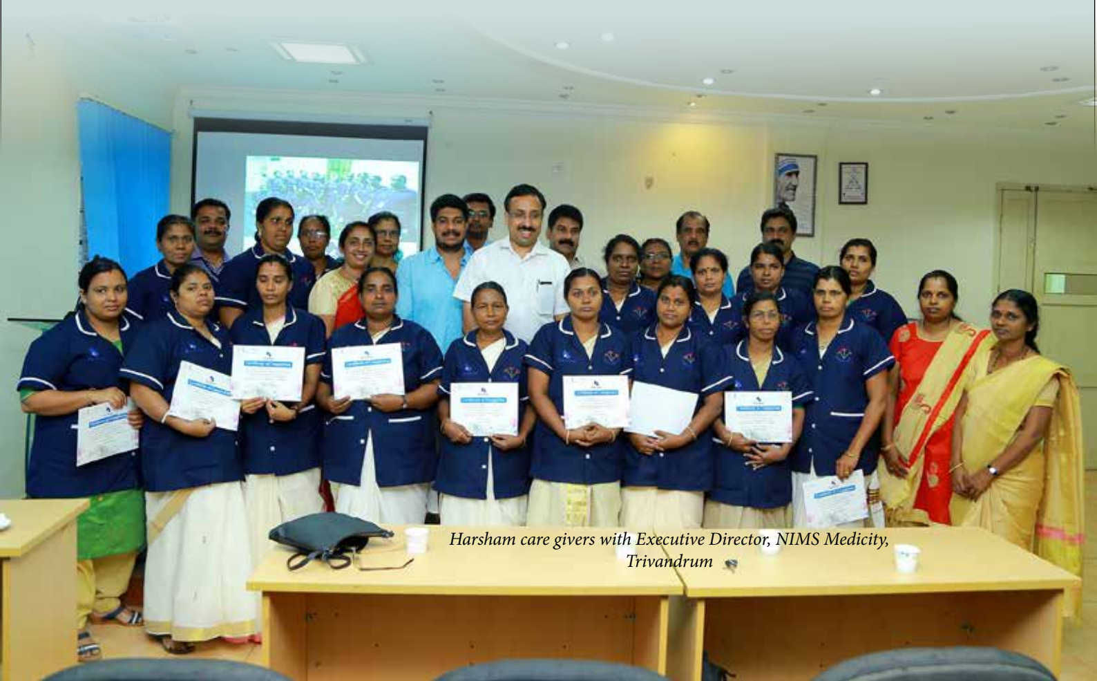
Harsham care givers with Executive Director, NIMS Medicity, Trivandrum

Kudumbashree is an organization working for the empowerment of women through need based enterprise interventions. The project "Harsham" by the Kudumbashree will work with a motive for promoting health of the elderly by providing a set of home based comprehensive services which could address majority of the mentioned problems faced by the geriatric population and will aid in healthy ageing. We are positively looking for the effective implementation of this project by concentrating on the various needs of elderly and by providing maximum employment opportunities to Kudumbashree members. We hope by 2019, some best Kudumbashree models will be established in Kerala for providing elder care assistance and it will set some remarkable identity to us.