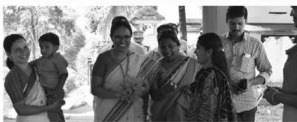
കൂടുമ്പുഴയിലുള്ള സ്നേഹിത ഹെൽപ്പ് ഡെസ്ക് മന്ത്രി കെ. കെ. ശൈലജ സന്ദർശിച്ചപ്പോൾ