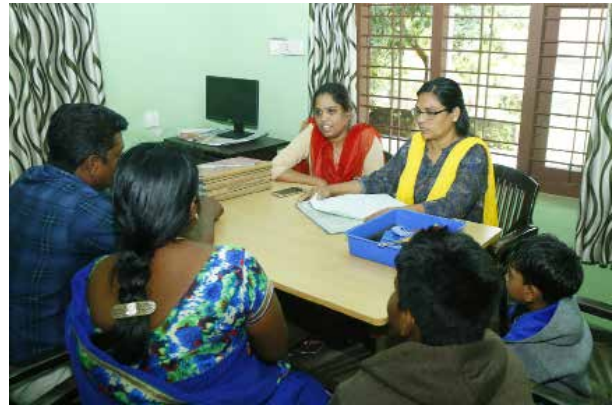
Psycho socio support by Snehitha Staff

Total number of case registered in Snehitha from the beginning is 22648 availed short stay for 4689 person. 6611 got counseling support.