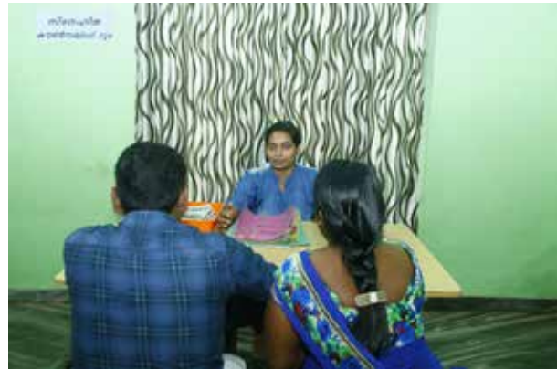
Counselling Session at Malappuram SNEHITHA

Snehitha is a 24hr working system. 11 staff was appointed in each Snehitha 2 Counselors, 5 service providers, 2 Securities, 1 office assistant and 1 Assistant(Cooking& Cleaning). All of them are women.. Kudumbashree governing body approved the number of staff and their wage. And as per this 5 category of post were notified by the mission in 2017 for the newly started Snehitha. Appointment of the staff in the pilot and next phase districts are directly recruited by Kudumbashree mission following written test, group discussion and interview. Interview