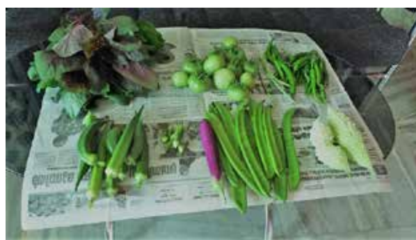
Poly house vegetables - Pathanamthitta Snehitha

Snehitha staff will be the responsible person for Gender resource centre activities in the concerned LSGI. Each Snehitha staff got duty of a block in every district. Community counselling, vigilant group activities, Block