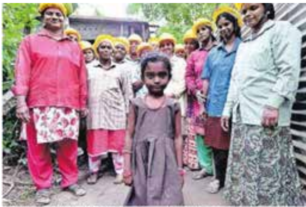
മാതൃകാ മിഷൻ അനുബന്ധ റീഡിംഗ് പരിപാടിയിൽ പങ്കെടുത്ത കുടുംബശ്രീ പ്രവർത്തകർ, തൃശ്ശൂർ.