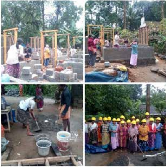
Photo 3: Ongoing Construction LIFE House at Naranamozhy Panchayat – Pathanamthitta

- Regular follow up with Government departments and LSGIs for getting more construction projects.