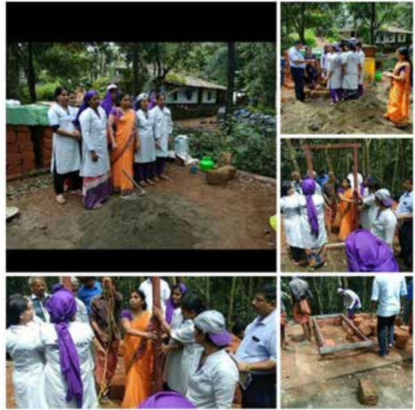
Photo 5: Ongoing Construction LIFE House at Vettathur Panchayat – Malappuram

- Adapt to Low cost construction projects (like FRBL prefab gypwall).