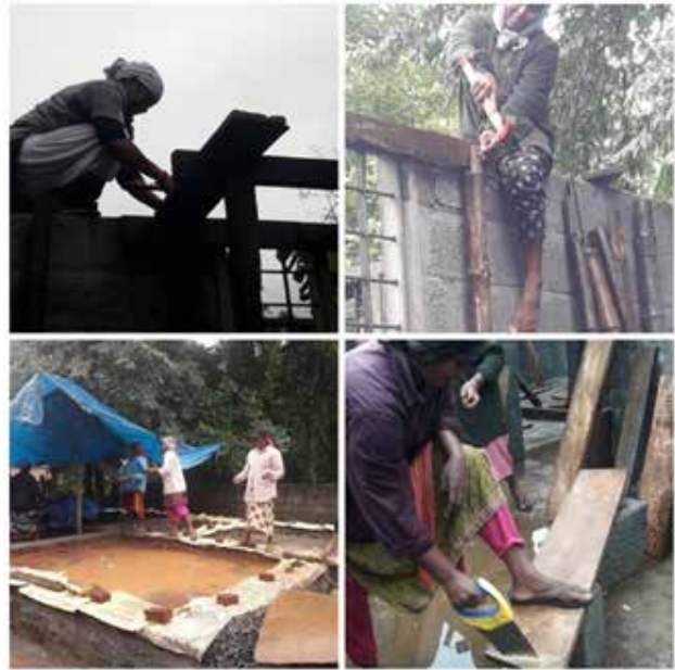
Photo 4: Ongoing Construction LIFE House at Akathethara Grama Panchayat – Palakkad