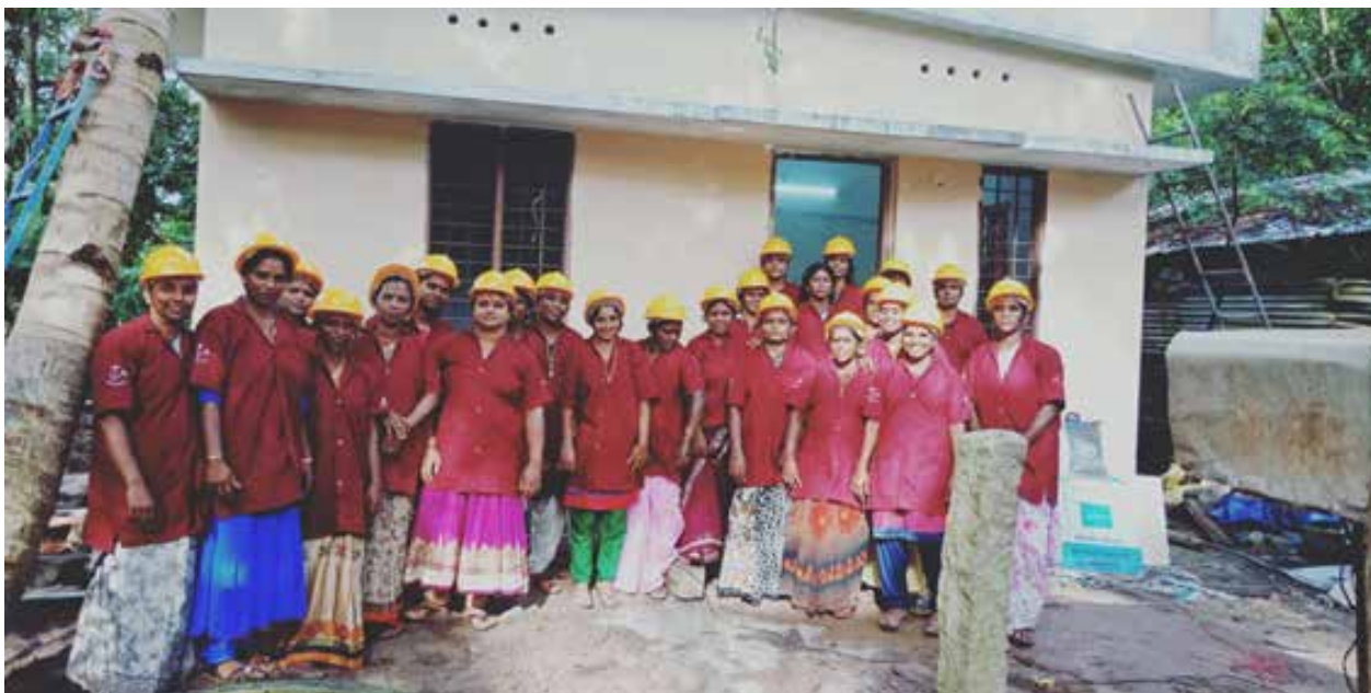
Photo 1: First LIFE Mission House Completed in 40 days at Harippad Block - Alappuzha