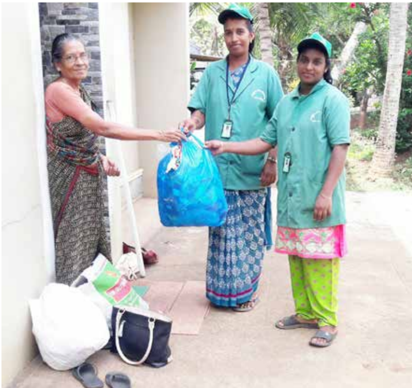
HKS-House hold plastic waste collection