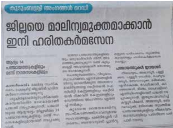
Figure 2: Article about Haritha Karma Sena activities in Kasargod,

respective LSGs. Haritha Karma Sena mainly focus on the collection and management of non bio degradable wastes.